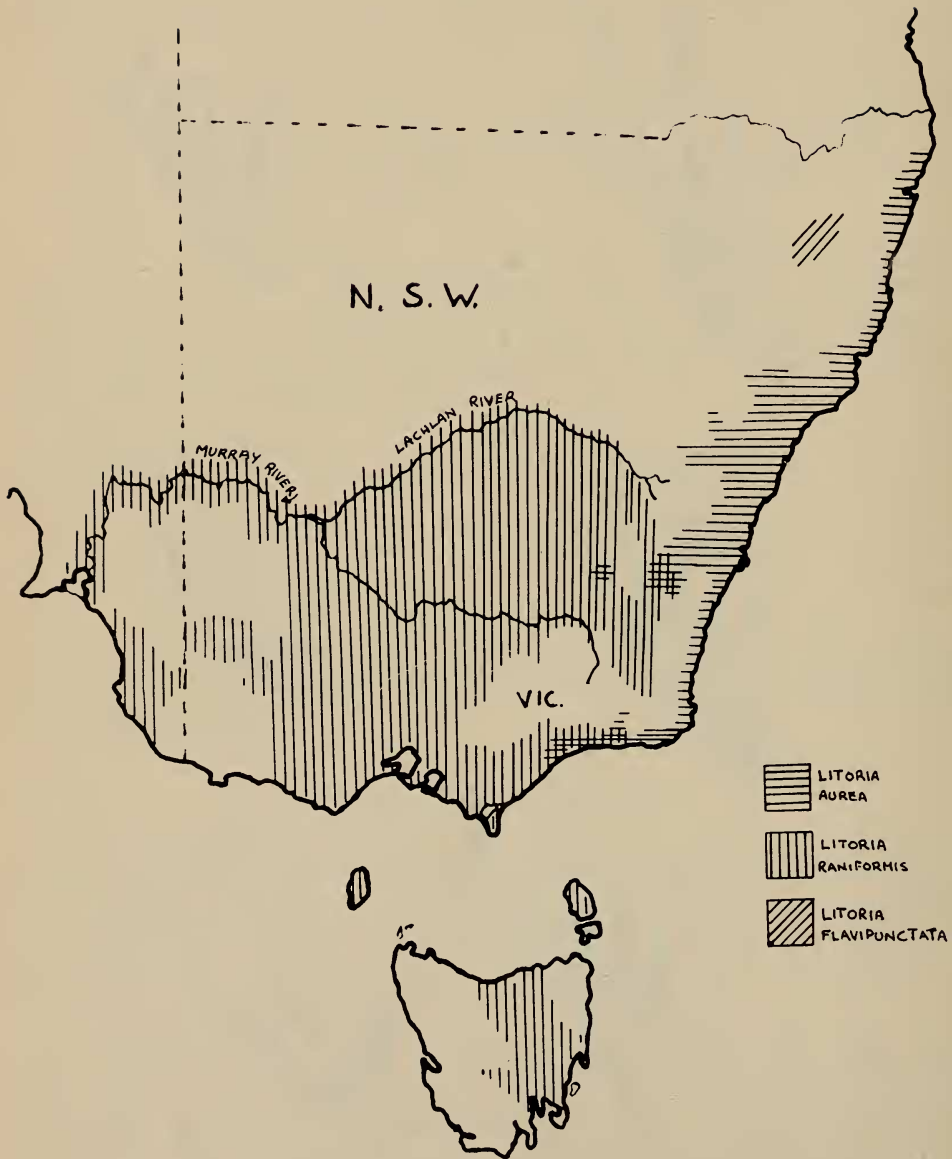
Fig. 2. Map of south-eastern Australia showing distribution of the Litoria aurea complex. The distribution of L. raniformis in Tasmania is based on Littlejohn (1967).